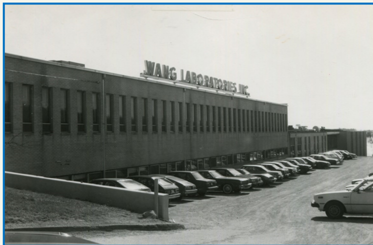
Wang Laboratories- Tewksbury, circa 1970

In 1977, Wang moved its headquarters to Lowell, MA, where they remained until 1993, when the iconic Wang Towers was sold at auction due to bankruptcy.