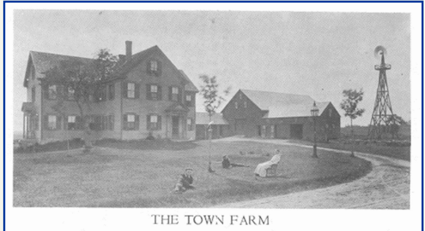
THE TOWN FARM